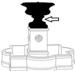
FT-30A (134 lbs) 18"L x 18"W x 21"H