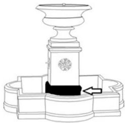
FT-29B/30C (52 lbs) 12"L x 12"W x 8"H