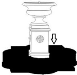
FT-29C/30D (579 lbs) 45"L x 45"W x 11"H

Assemble your fountain on a level surface capable of holding a minimum of 1135 pounds with an approximate 14 square foot footprint.