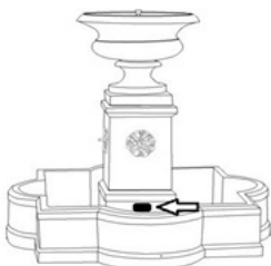
FT-29BB/30CC (4 lbs) 5"L x 1"W x 5"H